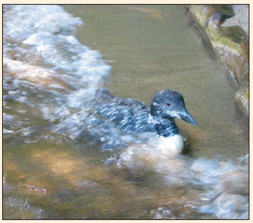
Loon with lead poisoning found by beach in Great Pond

Orvis carried nontoxic weighted wire and split shot, the latter in a holder with a rotating cover for opening individual compartments. Prior to that, a single container held my different-sized lead sinkers all mixed up, so the switch to the safer stuff was pig simple and more convenient for finding the right weight split shot in its own bin.