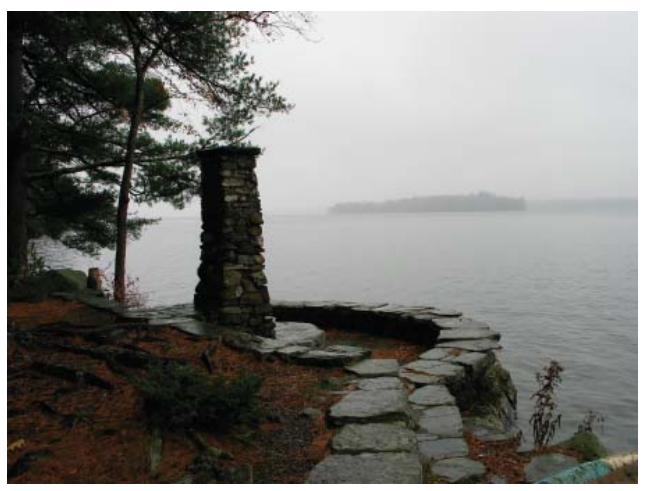
Where is this?

On the surface, little has changed since the community's beginnings 150 years ago. The road is now paved and no longer lined with elm trees, but the bustling contentment of a summer morning remains constant. People return here each year, beckoned back to the lakes for another summer spent in the Maine outdoors. A closer look, however,