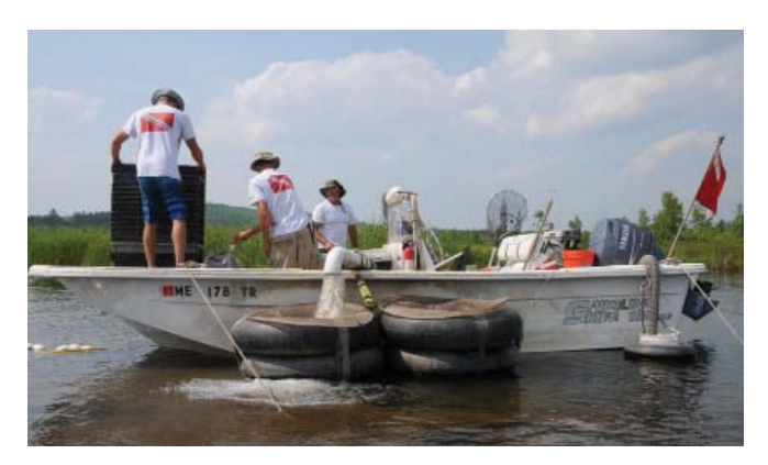
Members of the New England Milfoil dive team using their DASH boat to remove invasive milfoil from Great Pond.

The hookah pump system uses umbilical tubes to provide oxygen for up to 3 divers. This allows them to stay underwater water for extended periods of time without having to use the more bulky and expensive traditional scuba tanks.