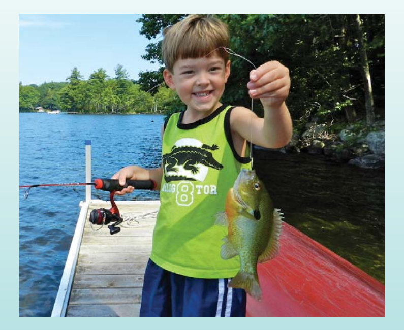
Enjoy Summer 2014 in the Belgrades and remember that size isn't everything! See you on the lake!